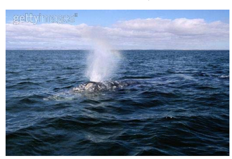
California Grey Whale "Blow"

The Woody's Whale Watching Wextravaganza will be Sunday January 28th! The day will begin with breakfast at Red Sails at 10AM. We usually have a good turnout and a large table so you don't want to arrive late for seating. We plan on leaving the dock at Cortez Marina around 11:30. For those of you joining us from other marinas, we can rendezvous in the channel or offshore. We can talk on channel 69. Bring your cameras because if you don't see a whale you can at least take a picture of your friend's boat. If you don't see a friends boat you have the wrong day.